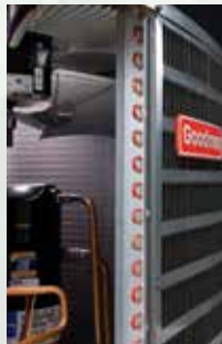
Goodman's SMARTCOIL™ 5mm tube condensing coil design optimizes the heat transfer ability of R-410A refrigerant compared to standard 3/8" copper tubing.

You can count on your Goodman brand GSX16 Air Conditioner to keep you cool on even the hottest summer days. Your Goodman brand air conditioner starts with a high-performance compressor that operates in tandem with our high-efficiency coil. The coil is made of rifled refrigeration-grade copper tubing and corrugated aluminum fins in a design that maximizes surface area. These high-quality components together cool your home effectively.